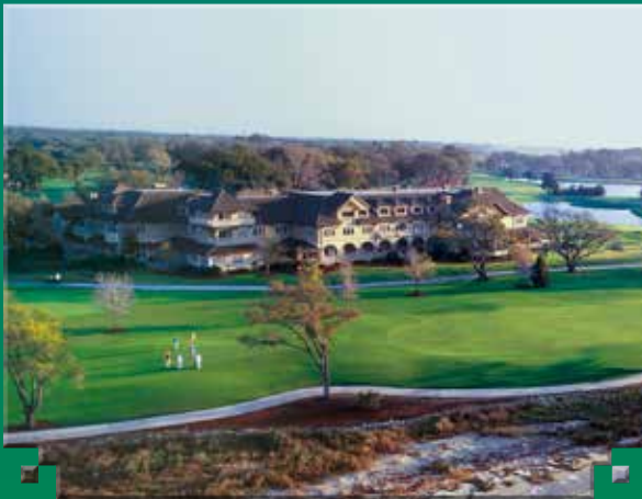
THE CLOISTER SEA ISLAND, GEORGIA